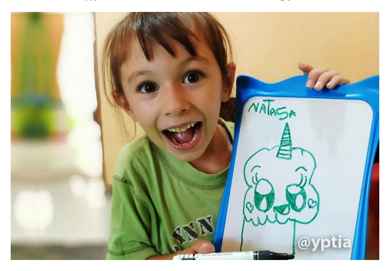
We are excited to help them to reach their dreams of wanting to create the world with full of love for children....