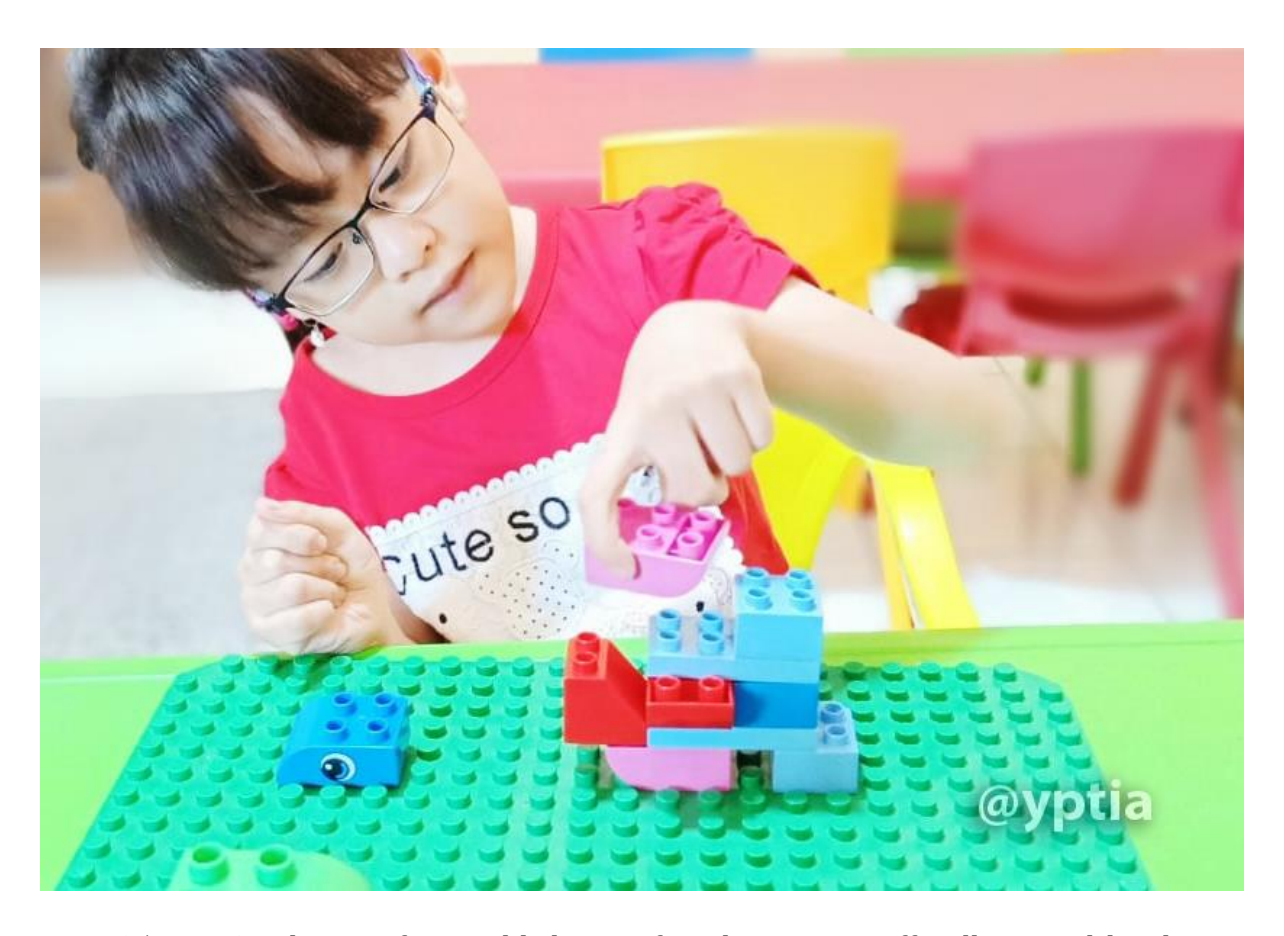
In 2015 YPTIA a license for establishing a foundation was officially issued by decree KEMENHUMHAM REPUBLIK INDONESIA AHU-0017293.AH.01.04.Tahun 2015 and made YPTIA increasingly focused on the vision, mission and reach a wider support in reaching steps in the movement on instill public and family awareness.

time. The whole team, together really tirelessly support each other happily and present in the midst of society. The team has been educating families and train children from an early age with specific skills-based Multiple Intelligences which are important for the future. Other than that, they held various training events, which entirely free for the teachers of early children education and elementary to optimize self-ability in managing and teaching the students by environmental use and technology that still claimed very exclusive by people through seminars, workshop, and other assisting program.