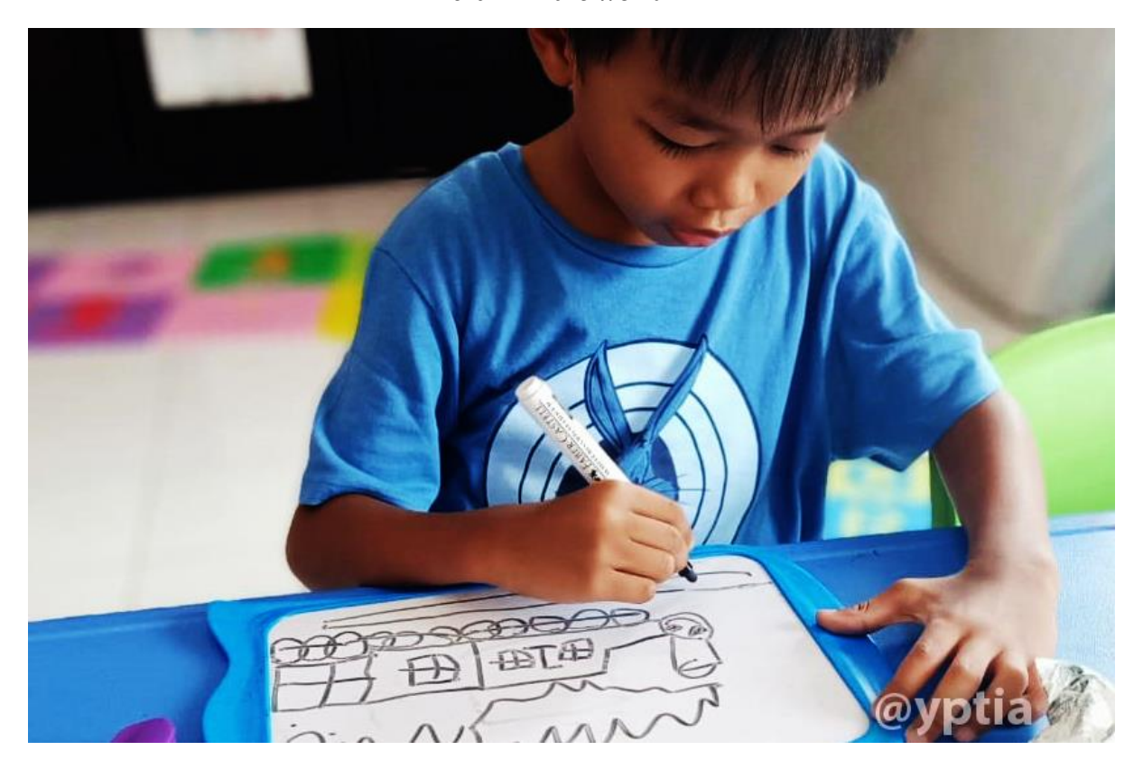
We were touched when they diligently wrote about their future and beautiful hopes for their families ...